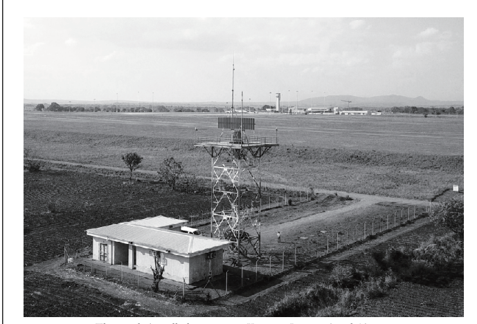
The newly installed antenna at Kamuzu International Airport