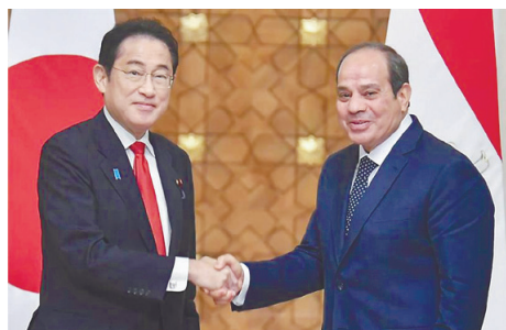
President Abdel Fattah el-Sissi poses with Prime Minister Fumio Kishida at the Presidential Palace in Cairo on April 30.

I take this outstanding occasion to review the flourishing relationship between Egypt and Japan, which is deeply rooted in history. Japan was always a reliable partner to Egypt, and the existing cordial relations were recently upgraded to the level of a strategic partnership during a summit between our leaders in April. This strong, abiding relationship is reflected in several iconic cooperation projects, including the Cairo Opera House, the Egypt-Japan