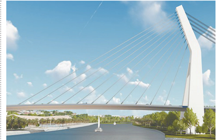
The New Alassane Ouattara Bridge is scheduled to be inaugurated later this month.

Our two countries have been linked since 1960 by an exemplary partnership based on shared values. Cote d'Ivoire and Japan share a common view on international issues and have consistently given joint priority to strengthening multilateralism, fighting climate change and fighting terrorism.