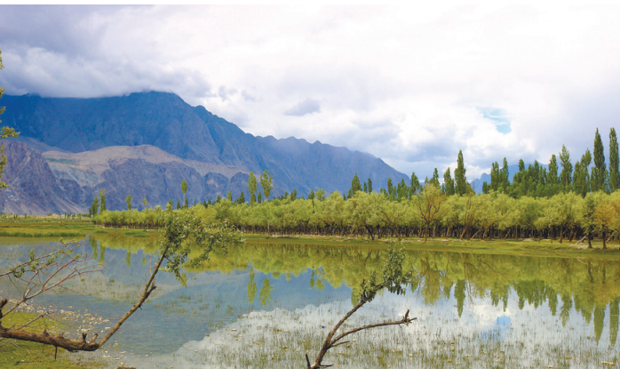
Left: Scenic Katpana Lake is in the midst of a high-altitude desert in the Gilgit-Baltistan region. Right: A hiker poses in front of Mount Rakaposhi, a formidable peak in the Karakoram range.

May prosperity continue to reign in Pakistan.