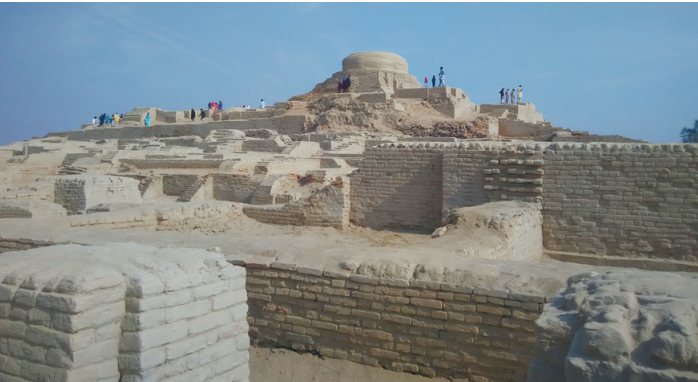
The Indus Valley Civilization was one of the world's most developed civilizations about 4,500 to 5,000 years ago. Situated on the banks of the Indus River, the remains of the Harappa and Kot Diji ethnic groups belong to this great civilization.

Congratulations to the People of the Islamic Republic of Pakistan on the Anniversary of Their Independence