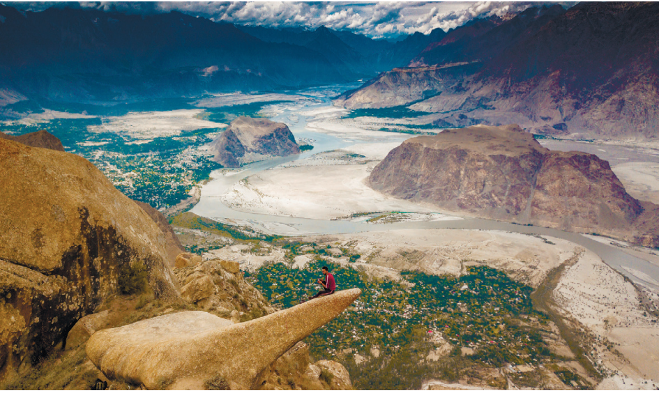
A hiker gets a breathtaking view from Marsur Rock, a 3,600-meter geological marvel in the Hussainabad Valley near Skardu that has become a tourist draw in recent years.

This content was compiled in collaboration with the embassy. The views expressed here do not necessarily reflect those of the newspaper.