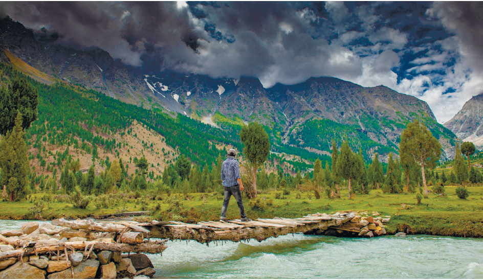
The Basho Valley near Skardu in the Gilgit-Baltistan region is covered with lush evergreen forests of pine, juniper and other tree species. QAMMER WAZIR

Japan is also one of Pakistan's key partners in the fields of education, manpower,