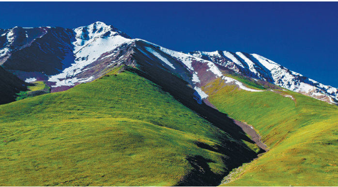
The Shila Valley, adjacent to Deosai National Park in the western Himalayas in Gilgit-Baltistan, is a popular tourist spot known for its scenic views and many lakes. QAMMER WAZIR