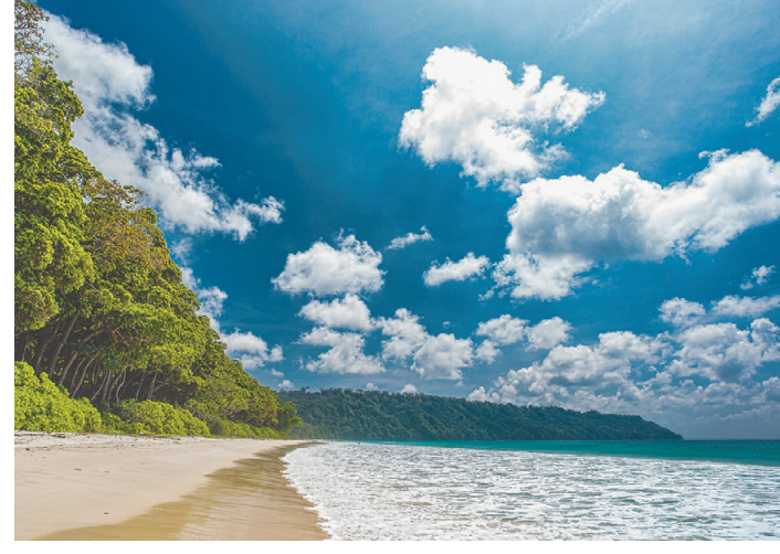
Left: Traditional houseboats float off Alappuzha in Kerala state. Right: Havelock Island is part of the Andaman Island chain.