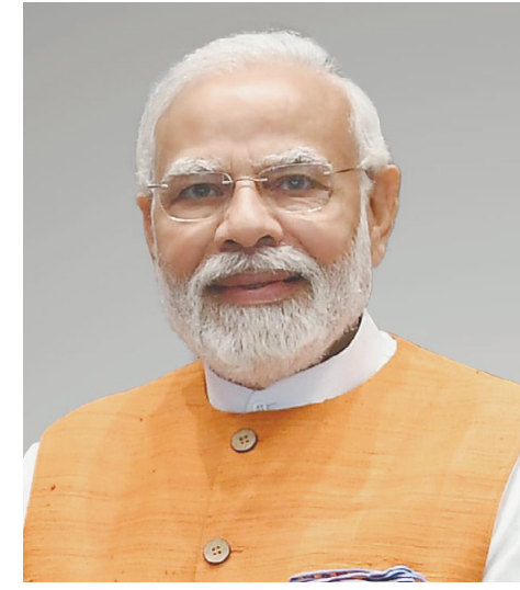
Prime Minister Narendra Modi