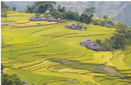
The terraced rice paddies of Ha Giang province EMBASSY OF VIETNAM

With the spirit of self-reliance, independence and resilience, from a country ravaged by wars and suffering from isolation and embargo, Vietnam has since grown by leaps and bounds. Given the successful implementation of the Doi Moi restoration, Vietnam has transformed itself into one of the most dynamic and attractive economies in Asia, and a link for multidimensional economic connectivity in international supply and value chains. The Vietnamese economy has integrated extensively into the world econ-