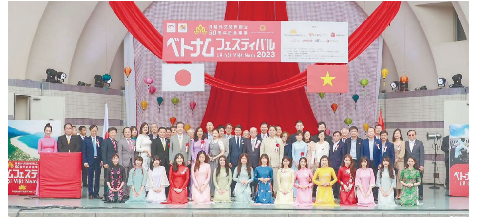
Participants pose during the opening ceremony for the Vietnam Festival in Tokyo in June.

Celebrating the 50th Year of Japan-ASEAN (Association of Southeast Asian Nations) Friendship and Cooperation, we would like to deepen our collaboration with Vietnam even further to strengthen the Japan-ASEAN relationship. At the same time, it is my earnest hope that Japan-Vietnam ties will make further progress in the next 50 years. We will continue to work hand in hand with Vietnam as reliable partners and do our utmost to ensure that the friendship between our countries goes from strength to strength.