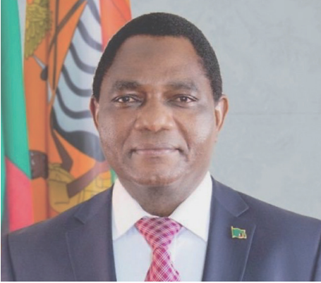
President of Zambia H.E. Hakainde Hichilema

Zambia is committed to further strengthening bilateral relations with Japan, especially in the diversification of the supply system for critical resources to eventually meet the country's goals through joint investments. It is envisaged that such partnerships and cooperation between our countries will accelerate mutually beneficial investment projects involving Japanese companies in Zambia.