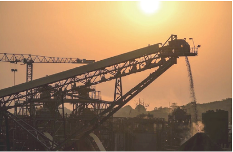
Above: Mining activities in Zambia's Copperbelt province; Above right: The Zambezi River flows into Victoria Falls, one of the world's largest waterfalls.

With this in mind, the association and the ECC Group of Schools will continue to make efforts in the hopes of strengthening and increasing the ties of friendship between our two nations.