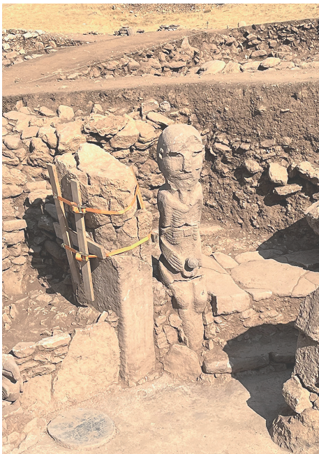
Left: Ortakoy Mosque sits on the European side of the Bosphorus. Right: Neolithic period sculptures have been discovered at the Karahan Tepe archeological site in Sanliurfa province, southern Turkiye.

Congratulations on the 100th Anniversary of the Republic of Turkiye