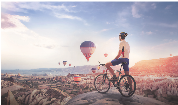
A cyclist watches hot air balloons rise above Cappadocia.