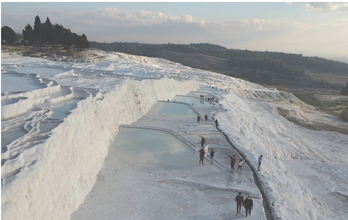
Visitors walk along the white travertine terraces formed by mineral deposits left by the famed hot springs at Pamukkale, Denizli province.