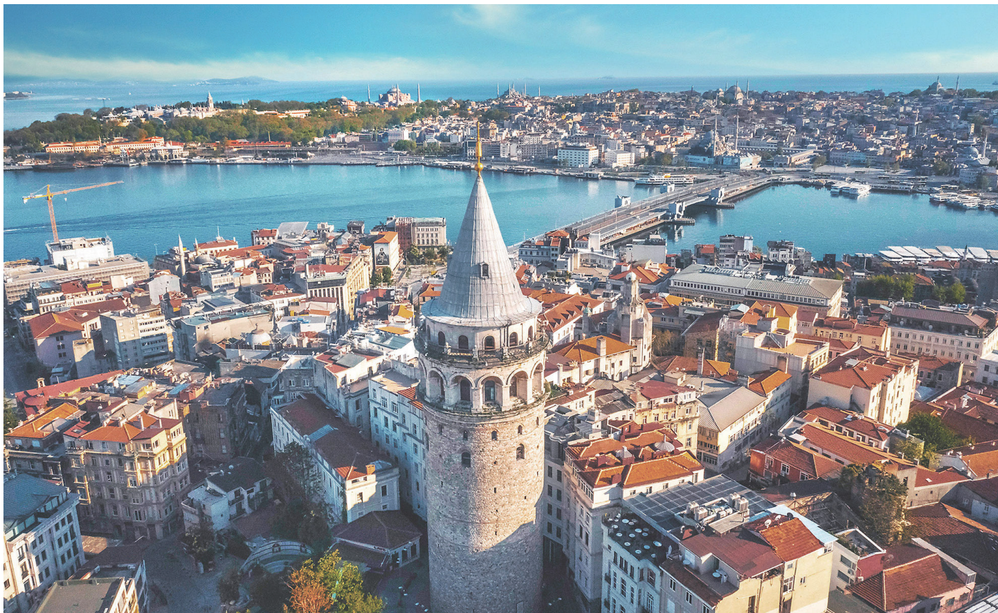
Galata Tower rises above the Blue Mosque and Hagia Sophia in Istanbul.