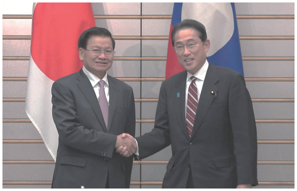
Prime Minister Fumio Kishida greets President Thongloun Sisoulith at a summit meeting in Tokyo on May 25.

Japan has been the top donor of official development assistance to the Lao PDR