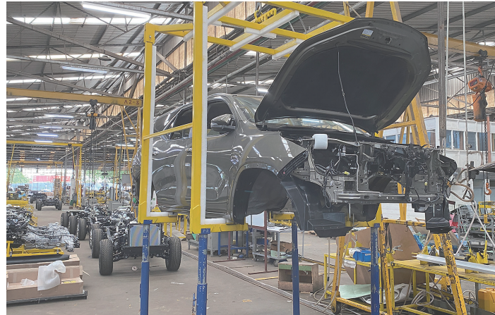
A Toyota Fortuner moves down an assembly line at a Toyota Tsusho factory in Mombasa.

Congratulations to the People of the Republic of Kenya on the Anniversary of Their Independence