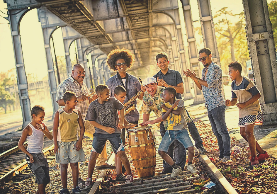
Havana boasts a vibrant dance and music scene.

In the economic and commercial sphere, the participation of the president of the Japan-Cuba Economic Conference in the 39th edition of the Havana International Fair, a space that allowed for verification of business opportunities in Cuba