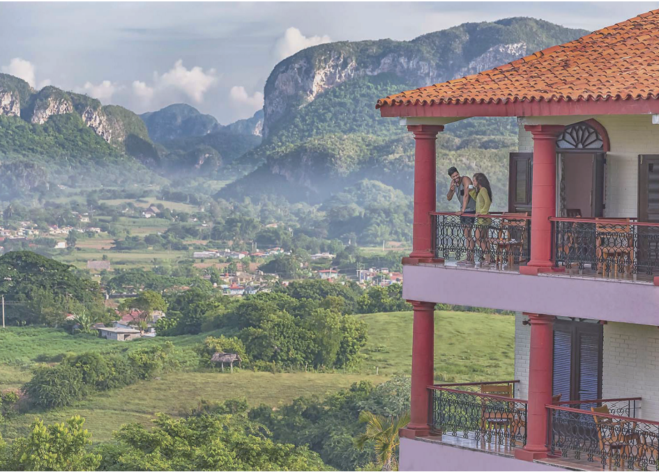
Pinar del Rio is one of Cuba's three main coffee-growing regions.

2023 was a very active year for Cuba in foreign affairs. Among the main results were the pro tempore presidency of the Group of 77+China, which represents most of the countries in the world and nearly 80% of its population, and which held its summit in Havana in September.