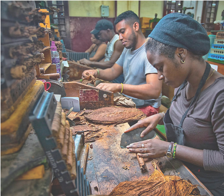
Cuban cigars are regarded as some of the best in the world.

Sports relations between our countries continued to strengthen as well. The Cuban baseball team that participated in the fifth World Baseball Classic used training bases in the prefectures of Okinawa and Miyazaki, and played exhibition games with clubs from Nippon Professional Baseball. The latter games, held prior to the WBC, were attended by large crowds