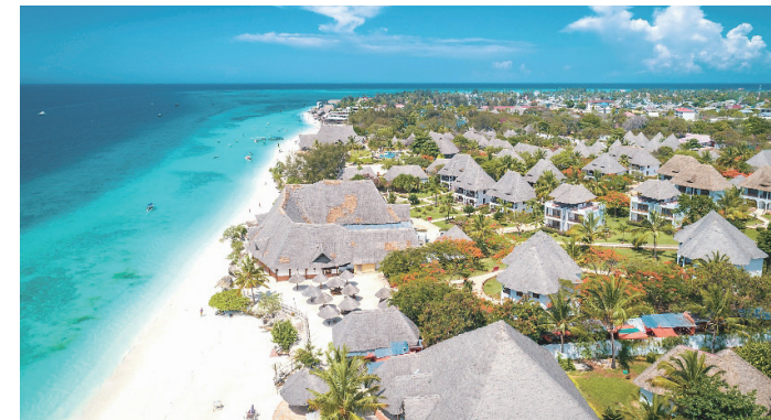
Above: Mount Kilimanjaro, the tallest mountain in Africa, serves as a backdrop to a group of giraffes. Left: The white sand Nungwi Beach is a popular tourist destination on the island of Zanzibar.

This content was compiled in collaboration with the embassy. The views expressed here do not necessarily reflect those of the newspaper.