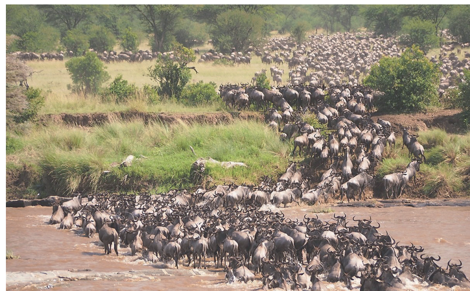
Top: A herd of wildebeest cross a river on the Serengeti Plain. Below: Tanzania boasts many coastal destinations along the Indian Ocean.