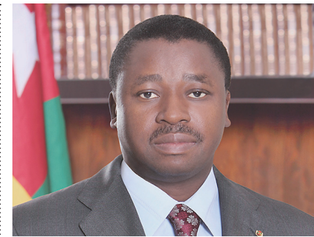
President of Togo Faure Essozimna Gnassingbe

This content was compiled in collaboration with the embassy. The views expressed here do not necessarily reflect those of the newspaper.