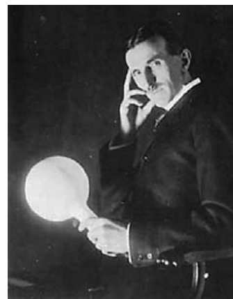
Science pioneer: Nikola Tesla, the great Croatian and world scientist

Tokamachi is the true "Capital of Friendship" between Japan and Croatia. I have nev-