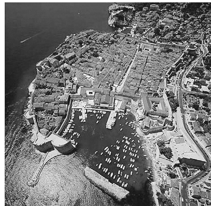
Jewel of a city: Dubrovnik, often called the "Pearl of the Adriatic"

Highly skilled Croatian engineers were the main reason renowned auto components maker Yazaki set up a center