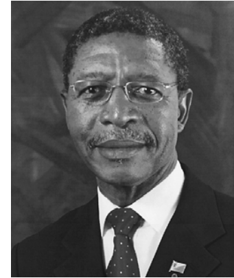
Lesotho Prime Minister Pakalitha Mosisili

Lesotho offers a good choice of accommodations, ranging from sophisticated hotels and casinos to lodges and bed-and-