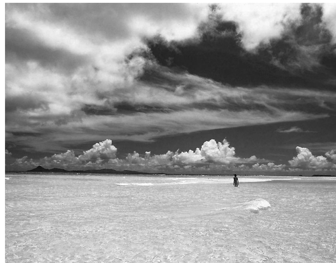
Island paradise: Micronesia offers visitors a beautiful, safe and comfortable haven for rest, recreation and relaxation. FSM VISITORS BOARD

The FSM is opening its door for tourists with our traditional hospitality so that discerning visitors can enjoy the beautiful, safe and comfortable haven for rest, recreation and relaxation.