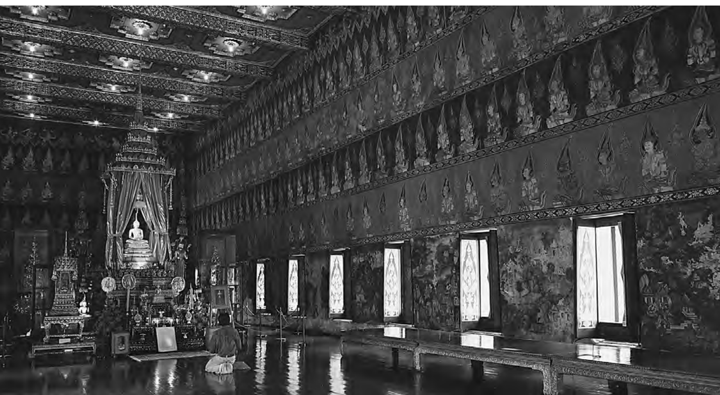
House of worship: Bangkok National Museum's Buddhaisawan Chapel houses the Phra Buddhashing, an important sacred Buddha image. The paintings in this chapel are the oldest murals in Bangkok.

I cordially hope for a still stronger bond between Japan and Thailand. Let me again wish His Majesty the King of Thailand many happy returns of the day.