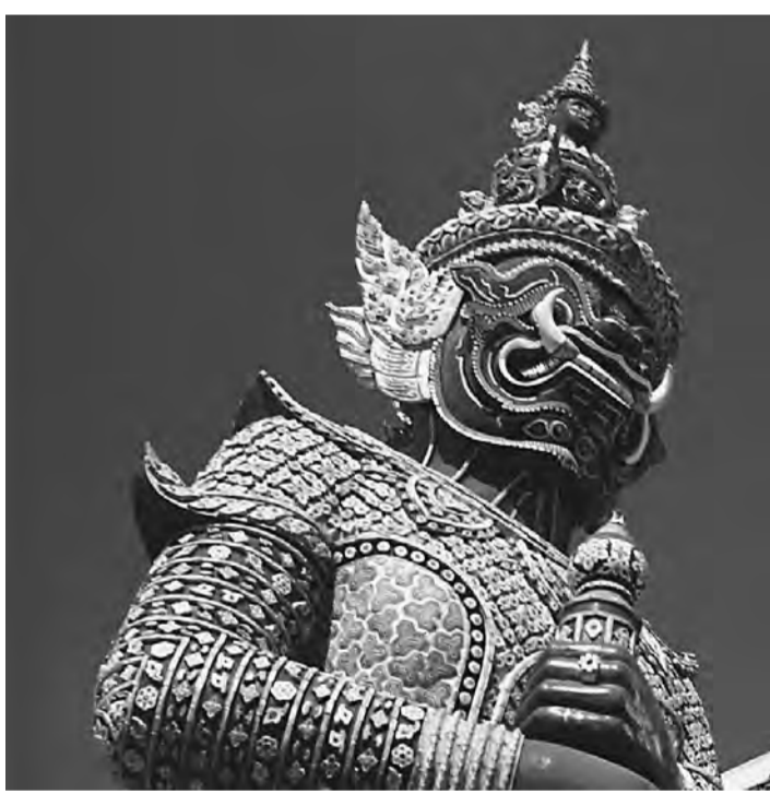
Temple guardian: A statue of demon called Yakshas greets visitors at the entrance to Temple of the Emerald Buddha.

Tokyo office is in the Yurakucho Denki Building, a one-minute walk from Yurakucho Station.