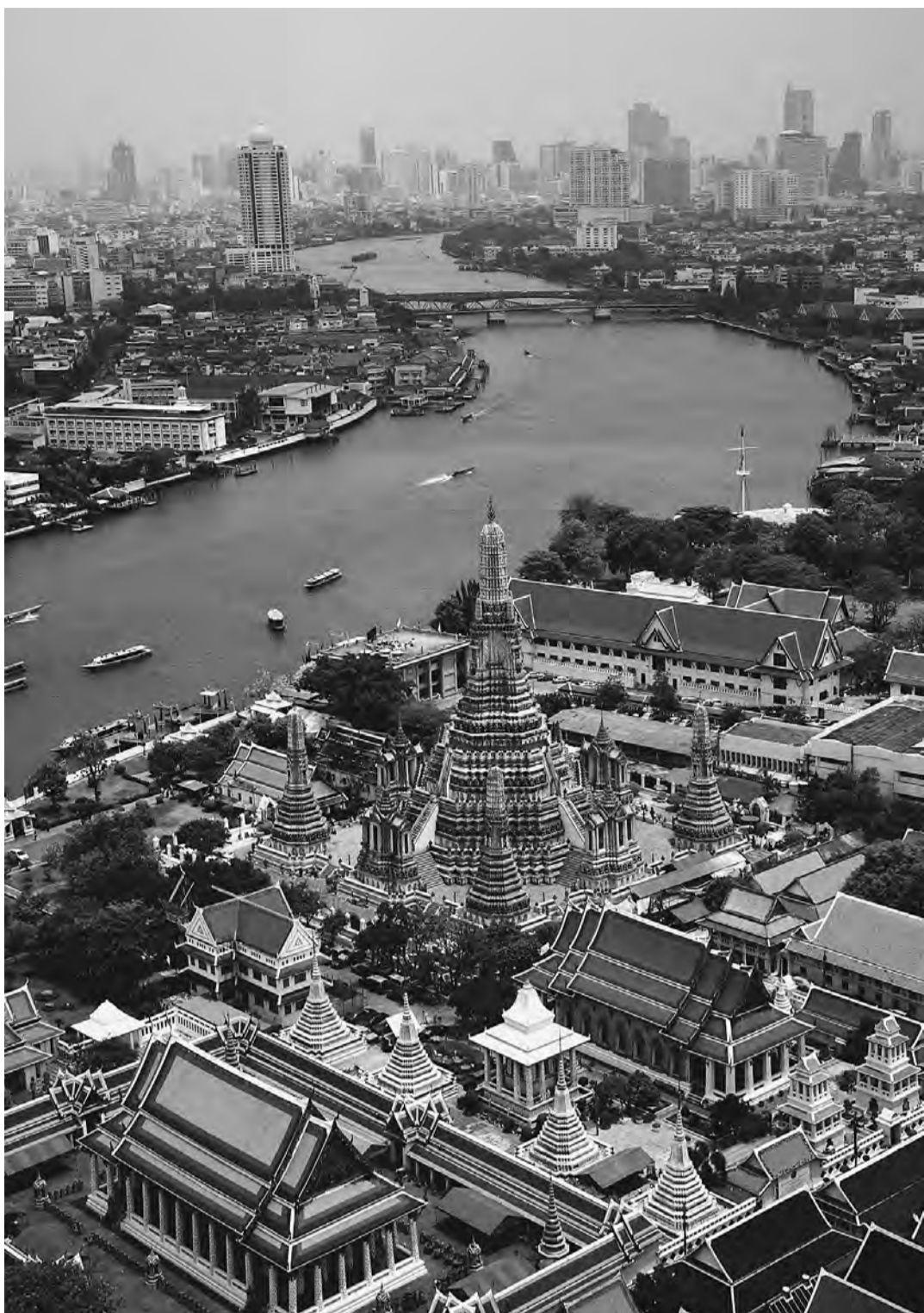
Landmark: Wat Arun, often called the Temple of Dawn, is one of the most distinctive buildings in Bangkok. From here one can see the Grand Palace, the Temple of the Emerald Buddha and Wat Po across the river.

While heading across town to Yaowarat, Bangkok's Chinatown, it is worthwhile to stop and admire an ancient solid-gold seated Buddha image of the Sukhothai Period at Wat Trai Mit at the end of Chinatown's Yaowarat Road near Bangkok Railway Station.