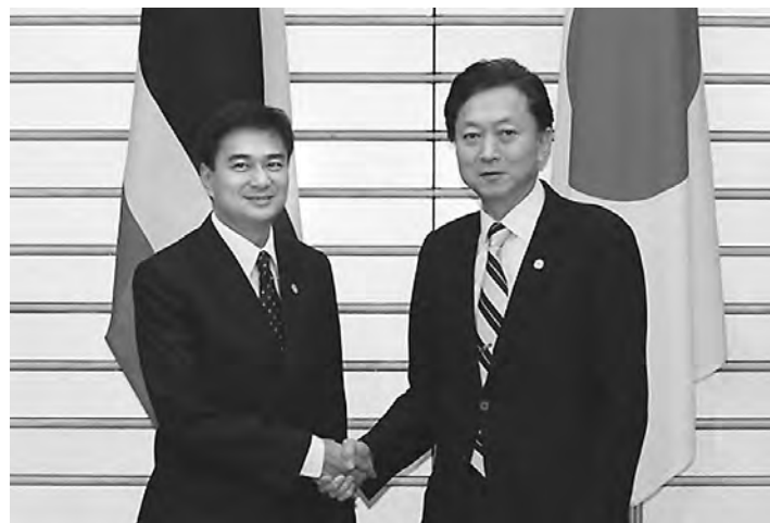
Close ties: Prime Minister Abhisit Vejjajiva of Thailand meets with Prime Minister Yukio Hatoyama on Nov. 7 during the first Japan-Mekong summit in Tokyo.

This year is also auspicious for the people of Japan, for it is the year in which Japanese people commemorate the 20th anniversary of the accession to the throne of His Majesty the Emperor and the 50th wedding anniversary of the Emperor and the Empress of Ja-