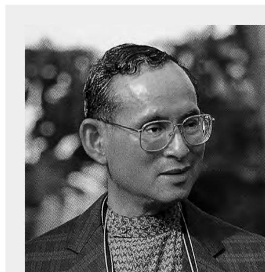
King Bhumibol Adulyadej, hospitalized for fever and fatigue, has postponed the birthday eve address.

Politically, the Thai and Japanese governments' relationship has been closer and more cooperative. Thailand, as this year's chair of ASEAN, hosted the 15th ASEAN summit and related summits in Hua Hin from Oct. 23 to 25, during which Prime Minister Abhisit Vejjajiva had a fruitful discussion on various issues of mutual interest with Prime Minister Yukio Hatoya-