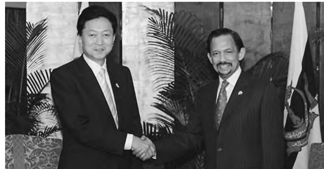
Good ties: His Majesty Sultan Haji Hassanal Bolkiah of Brunei Darussalam meets Prime Minister Yukio Hatoyama at the APEC summit in Singapore on Nov. 14.

In conclusion, we also would like to acknowledge the commendable role played by the Japan-Brunei Parliamentarians' League, Japan-Brunei Friendship Association and Kyushu-Brunei Darussalam Club in enhancing the relations. We hope that such collaboration between both countries at all levels will be further deepened and enhanced on a mutually beneficial manner in the years to come.