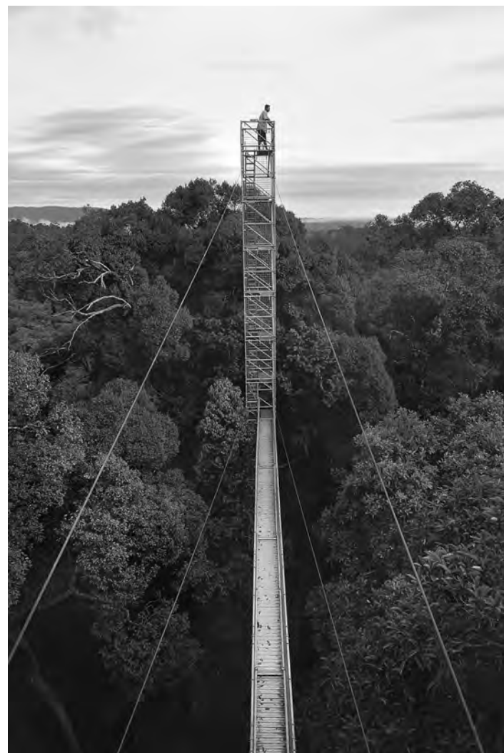
Canopy walk: Visitors enjoy the rain forest's surprisingly diverse treetop ecosystems.

The journey to the center will take up to 2½ hours of pushing and pulling a longboat over a series of 23 upriver rapids. But, aside from the sheer beauty of the site, its importance can be distilled from the experience of just one entomologist who found over 400 species of beetles on a single tree in this area.