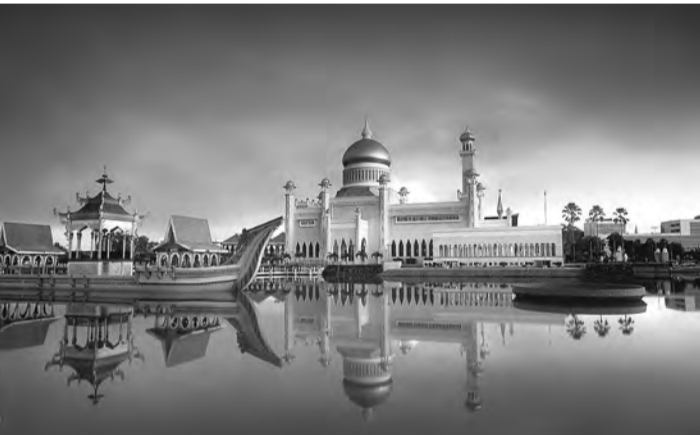
Landmark: The Sultan Omar Ali Saifuddin Mosque, built in 1958, dominates the skyline of Brunei's capital Bandar Seri Begawan.

In conclusion, I would like to extend my sincere and cordial wishes to His Majesty the Sultan and the people of Brunei Darussalam for their continued and further prosperity.