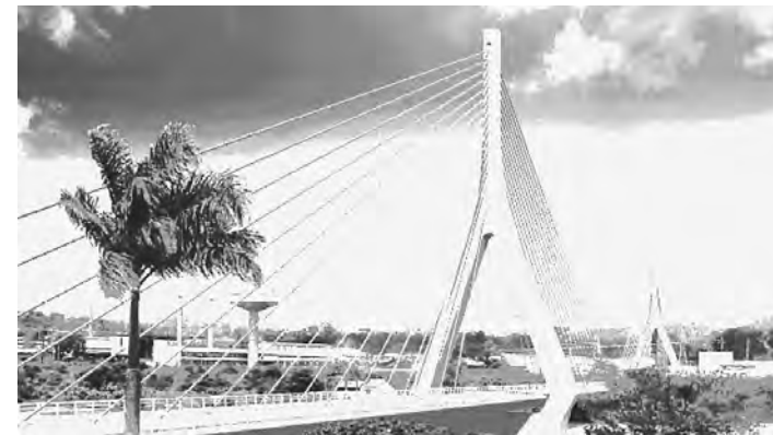
Uganda-Japan cooperation: The new bridge across the River Nile will be built in Jinja, Uganda.

On this occasion, I am further pleased to extend warm