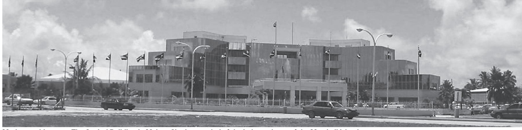
Modern architecture: The Capitol Building in Majuro City is a symbol of the independence of the Marshall Islands. EMBASSY OF THE MARSHALL ISLANDS