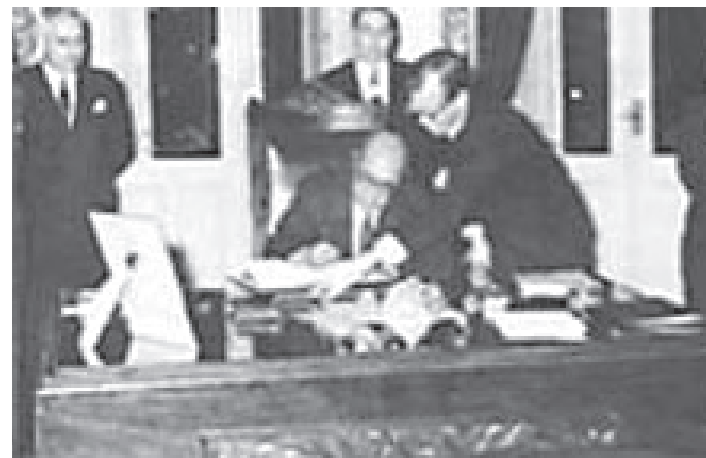
Close ties: A Japan-Paraguay Immigration Agreement was concluded in 1959.

Paraguay's strong relationship with Japan dates back to 1919, when the first treaty of amity was signed between the two nations. In 1936, the first 81 Japanese immigrants landed in Paraguay and settled in La Colmena, 130 km southeast of Asunción, the capital of Paraguay. The advent of World War II interrupted the flow of immigration thereafter, which resumed in 1954 a little while after the conclusion of the war in 1945. With the aid of the Paraguayan and Japanese government, the immigration continued and today over 7,000 Japanese and their immediate descendants now live in several parts of the country. Most Japanese immigrants engaged in agriculture and introduced tomatoes and many garden vegetables not commonly known or widely consumed before in Paraguay. In later years, many of the Japanese-Paraguayan farmers began growing soybeans, a staple from their native country. Soybean production is today the most important product produced and ex-