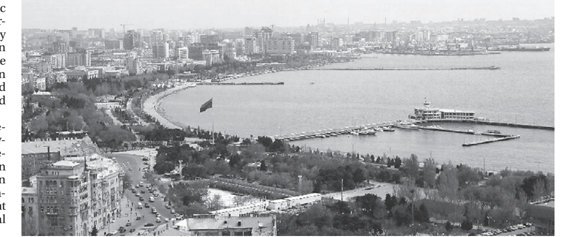
Capital: Located on the shore of the Absheron Peninsula, which projects into the Caspian Sea, Baku is the largest city and largest port in Azerbaijan. EMBASSY OF AZERBAIJAN