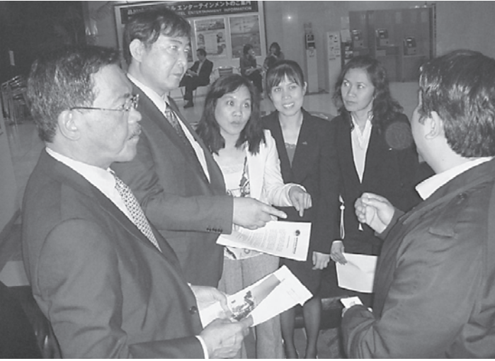
Staying put: Female Filipino caregivers in Fukushima meet with Philippine and Japanese officials.