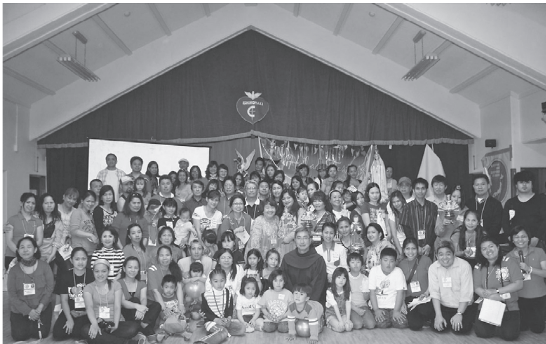
Strength in numbers: Philippine Embassy officials and Filipino community volunteers come together during a relief mission to Ishinomaki, Miyagi Prefecture, on May 21.

The Philippines actively participated in the Special Association of Southeast Asian Nations (ASEAN)-Japan Ministerial Meeting on April 9 in Jakarta to express ASEAN's solidarity with Japan after the Great East Japan Earthquake