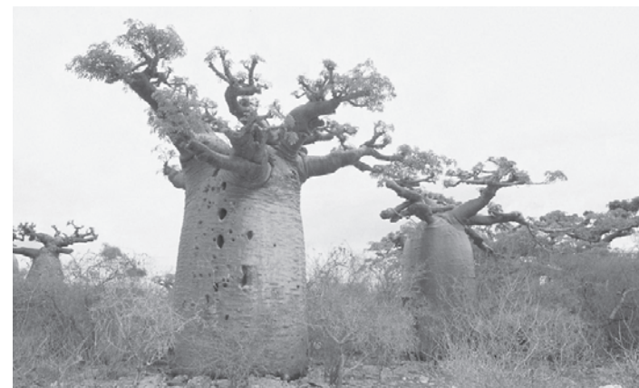
Unique tree: Six out of the eight species of baobab in the world are endemic to Madagascar and all six are threatened or nearly threatened by extinction.