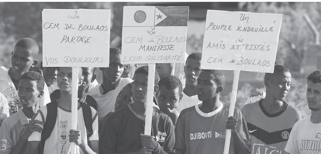
Sympathy: Djiboutian youths including students of the College de Fukuzawa in Djibouti show their support for Japan's quake- and tsunami-affected people at a solidarity day rally on March 23 in Djibouti.

Convinced that these positive trends will persist during this 34th year of our independence and beyond, I wish to congratulate the people of Djibouti, leadership and citizens, for their resilience and hard work toward creating a prosperous nation.