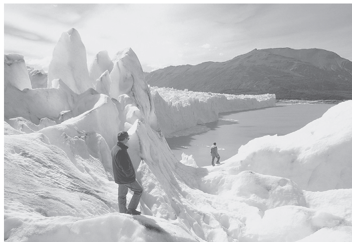
Majestic: The Perito Moreno Glacier is one of the major tourist draws in the Argentine Patagonia.

As for the bilateral economic and trade relationship, Japan is a major and successful foreign investor in Argentina, with com-