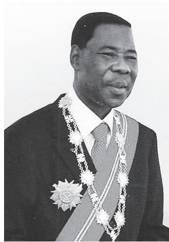
Benin President Yayi Boni

We should note that from the inception of the administration of President Yayi and since his re-election in March 2011, the government aims to transform the Benin economy into one of the emerging economies and the political system into a modern one. It is glorifying that these reforms and policies have begun to bear tangible fruits in repositioning the economy and has become one of the preferred destinations for foreign direct investment (FDI) in Africa. The results of these reforms have quickly made Benin a stable, peaceful and democratic reference in Africa. Because of this President Yayi received from his colleagues of Africa a mandate as chairperson of the African Union. Since then, he has been strengthening peace and democracy in Africa. Therefore, the African Union needs the support of the international community, of which Japan is an important member of all the decisions for democracy and peace in the world.