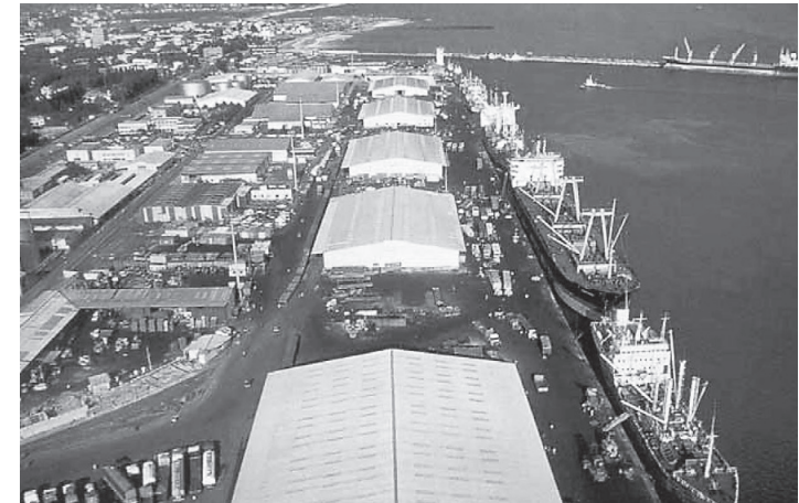
Economic center: Cotonou in the southeast of Benin is the country's largest city, a transport hub and a gateway to 300 million consumers in West Africa.

You can get in touch with the Benin Embassy through its website www.beninembassy.jp .