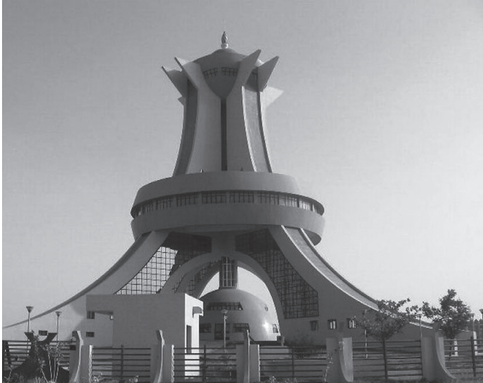
Monument: The memorial to the martyrs of Burkina Faso is located in the new district of the capital Ouagadougou. EMBASSY OF BURKINA FASO

The government of Japan has played a key role in the process of preparing this document. The government of Burkina Faso hopes that these efforts be continued, in particular to strength-