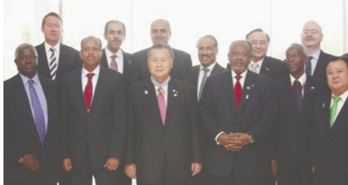
Strengthening ties: (Right) President of Djibouti Ismail Omar Guelleh and Prime Minister Shinzo Abe meet on June 1 in Yokohama on the sidelines of the fifth Tokyo International Conference on African Development (TICAD V). (Above) President Guelleh bestows the Commander of the National Order of June 27 on former Prime Minister Yoshiro Mori (front row third from left) on June 1 at a ceremony held in Yokohama attended by Djiboutian Foreign Minister Mahmoud Ali Youssouf (front row second from left), Arab ambassadors to Japan and friends of Djibouti.

Japan's image in Djibouti Djibouti has a long-standing and strong relationship with Japan, covering key aspects of our development and mutual friendship. Over the years, Djibouti has benefited substantially from financial and technical support provided by the Japanese government and its people. Through this invaluable support, Japan has made notable contributions to our national development agenda, which has enabled Djibouti to attain substantial achievements in terms of economic growth and in improving the welfare