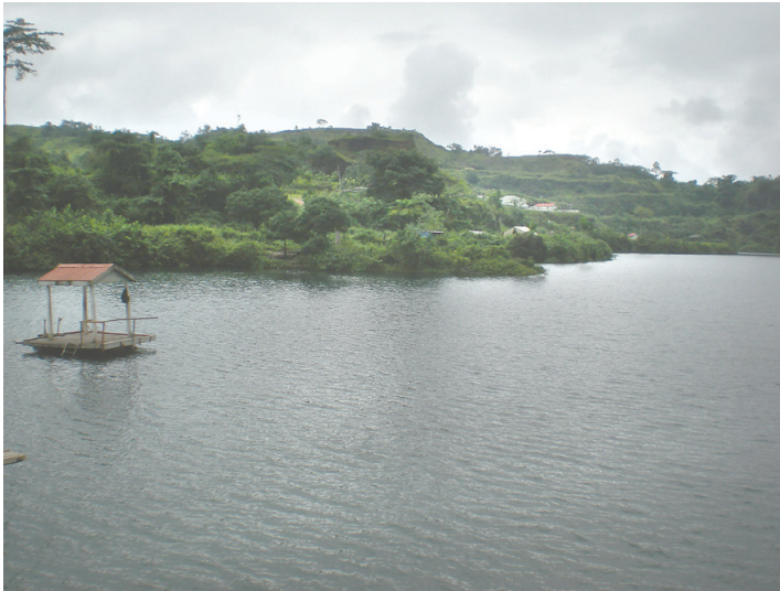
The Blue Lake is a natural wonder of Liberia. EMBASSY OF LIBERIA

Information provided by the Embassy of Liberia