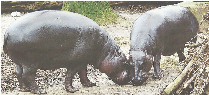
Pygmy hippos

As we are now witnessing the unfolding of positive signs and the window of opportunity opening for a robust business atmosphere, we are repeating our message to the Japanese private sector that Liberia is ready, open for business and the country welcomes Japanese investors to join.