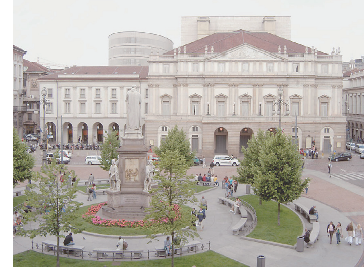
The La Scala opera house will be open through Oct. 31 this year.

Among the treats of the exhibition there will be also a full-scale video reproduction of "The Last Supper," enriched with descriptive panels and interactive stations featuring in-