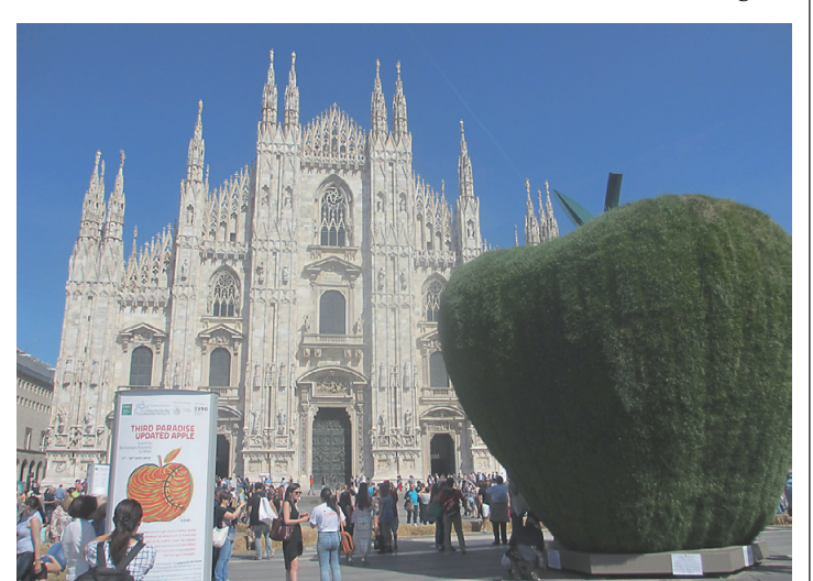
The installation "Third Paradise — The Reinstated Apple" that represents the detachment of humankind from nature was on display in Milan until May 18. HIROKO INOUE