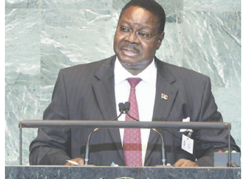
Malawi His Excellency Arthur

profitable free-market economy, strategically located between Zambia. Tanzania and Mozambique. The country is well positioned to act as a global export base in an increasing-