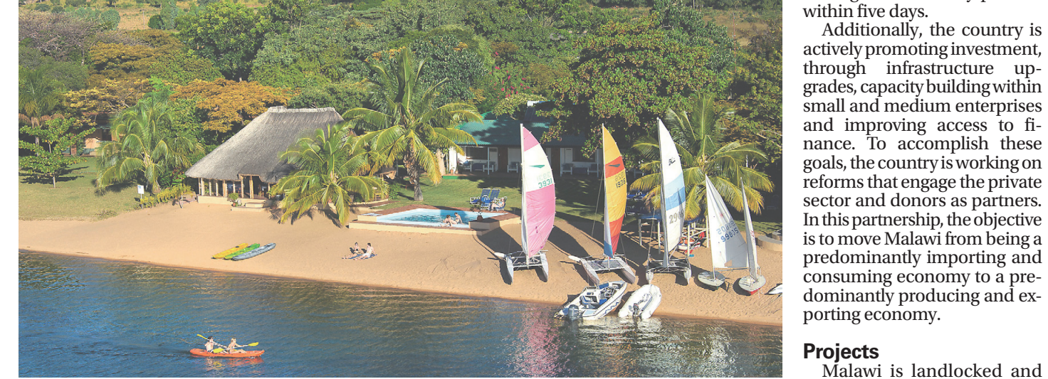
Boats at Lake Malawi EMBASSY OF MALAWI

(Official Authorized Toyota Distributor in Malawi) Queens Corner, Masauko Chipembere Highway, P.O. Box 430, Blantyre, Malawi TEL: 265-1841933 FAX: 265-1844424