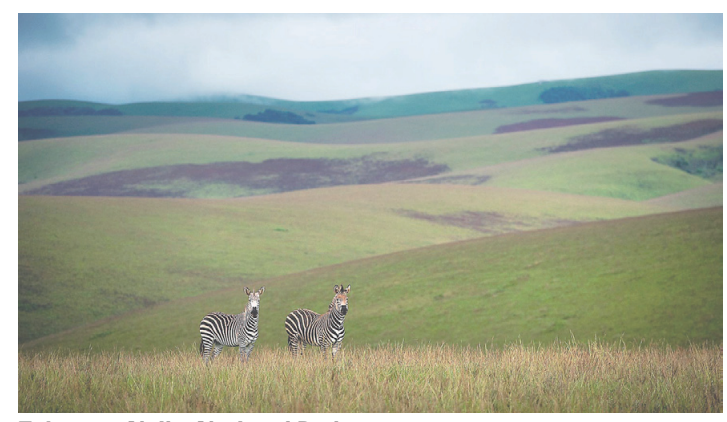
Zebras at Nvika National Park EMBASSY OF MALAWI

Malawi continues to enjoy support from Japan on its development agenda for which Ma-