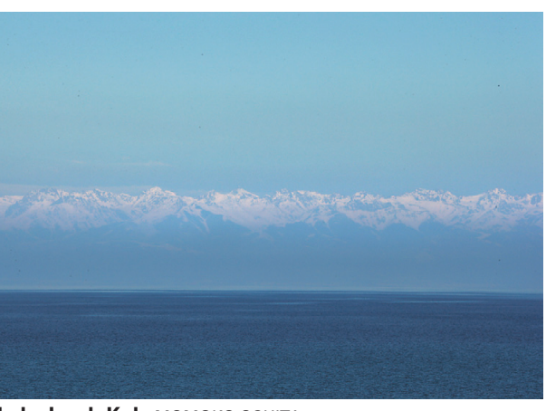
Celestial Lake Issyk-Kul MOMOKO OSHITA