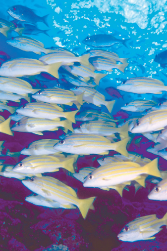
The Federated States of Micronesia is surrounded by rich nature and visitors can enjoy seeing beautiful tropical fish. EMBASSY OF THE FEDERATED STATES OF MICRONESIA

It is my belief that a relationship based on mutual understanding and true friendship will be a lasting one that our people can benefit from and be proud of.