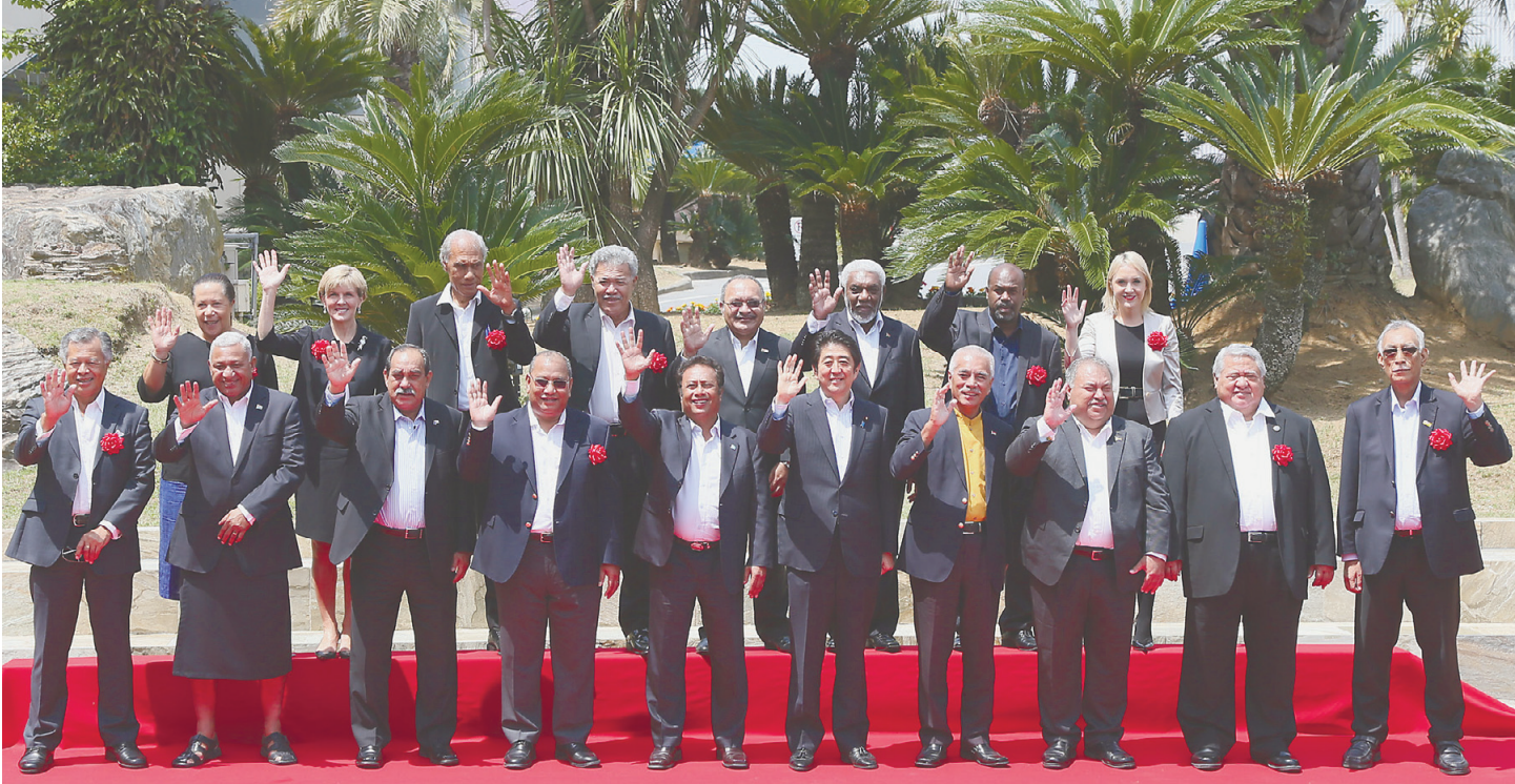
National leaders and representatives pose at the Seventh Pacific Islands Leaders Meeting, known as PALM7, in May 2015.

country with a history of ties to Japan that hosts generations of Japanese descendants. Because of these important connections, not only has the Japanese government, but also us in the private sector, in full force have promoted a wide variety of activities to deepen exchanges in the people, cultural and economic fields. This milestone of 30 years is a joy for us if the current bilateral ties and strong bonds are the fruits of such