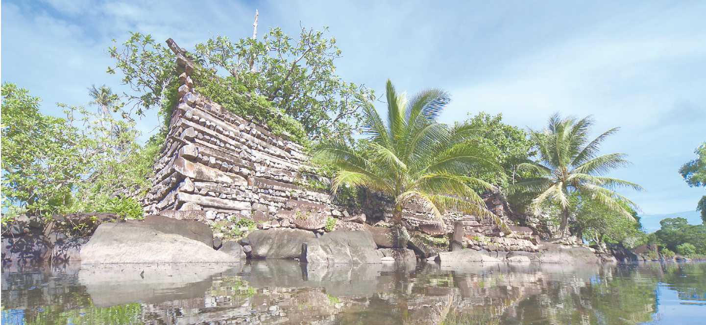
The ruins of Nan Madol, a city on the island of Pohnpei, is a UNESCO World Heritage site. AKIHIRO SUGIURA

but also importantly by Japanese fisheries companies' physical presence through joint ventures. As fisheries remain the most promising revenue-generating sector, and one of the most important pillars of our diplomacy with Japan, it is imperative for both countries to continue working together to expand and strengthen the collaborative efforts that have been