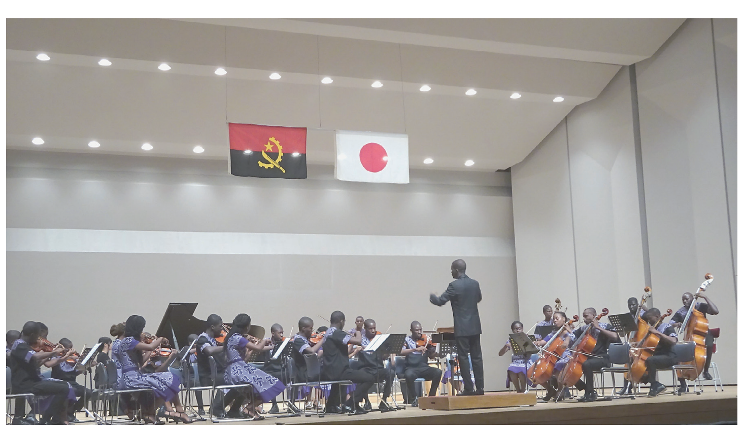
Kaposoka Symphony Orchestra performs in Sendai in May.

Angola has untapped possibilities in various fields such as agriculture, agro-industry, food processing, transport, logistics, mining, tourism, services and areas where Japanese investment and technology transfer can play an important role. I would like to take this opportunity to call upon Japanese companies to invest in Angola and enjoy the wide range of state support available for investors.