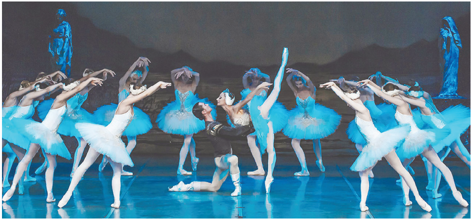
The Bolshoi Theatre ballet company performs "Giselle" on June 4 at Tokyo Bunka Kaikan.

It is also important to bring Russia and Japan's approaches together on urgent international issues, including the subjects of peace and stability in the Asia-Pacific region and on a global scale. This will benefit the peoples of our two countries, as well as the general situation in the world.