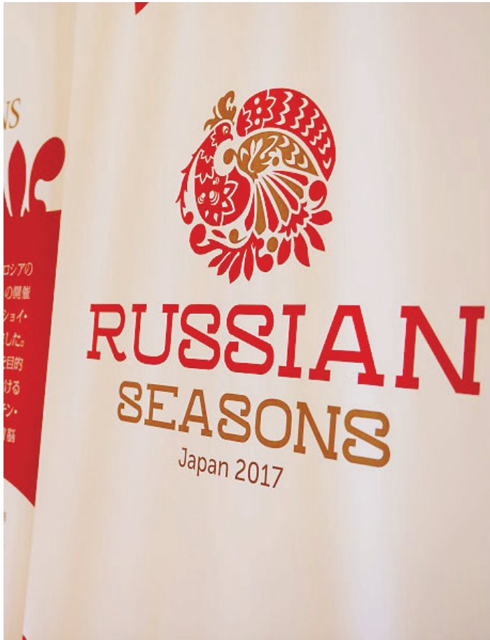
A sign introducing the "Russian Seasons" event in Japan