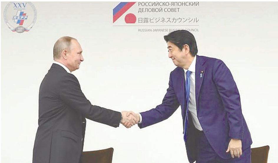
President Vladimir Putin and Prime Minister Shinzo Abe shake hands at the Japan-Russia Business Dialogue on Dec. 16 in Tokyo.

Russia-Japan relations have recently demonstrated positive dynamics. As is widely known, Russia, despite all the complexities of the current international situation, has never refused dialogue with Japan in both intergovernmental and inter-parliamentary formats,