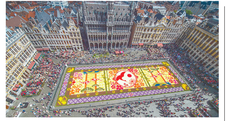
The Japan-inspired Brussels Flower Carpet 2016 was created to celebrate the 150th anniversary of bilateral friendship.

Congratulations on the Belgian King's Day \mathbf{\tilde{\mathbf{N}}} MEIKO TRANS Co., Ltd. Head Office: 4-6, Irifune 2-chome, Minato-ku, Nagoya, Aichi 455-8650 Japan Phone: (052) 661-8111 Fax: (052) 652-1680 http://www.meiko-trans.co.jp