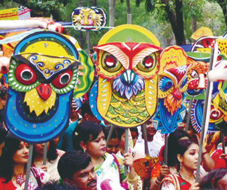
Mongol Shobhajatra, a procession held in the Bangla new year.

March 26 marks the Independence Day of Bangladesh. On the occasion of our great Independence and National Day, I extend my heartfelt greetings and warm felicitations to my fellow countrymen living at home and abroad. On this historic day, I recall with profound respect father of the nation Bangabandhu Sheikh Mujibur Rahman, who proclaimed independence on March 26, 1971. Under his able leadership, we achieved our independence through a nine-month long armed struggle. Today, I pay my deep tributes to the martyrs and valiant sons of the soil, who made the supreme sacrifices in the war of liberation. I also recall with deep reverence our four national leaders, valiant freedom-fighters, organizers, supporters and people from all walks of life for their unmatched valor, immense contributions and courageous role that accelerated the achievement of our victory. I remember with deep respect our foreign friends who extended their wholehearted support