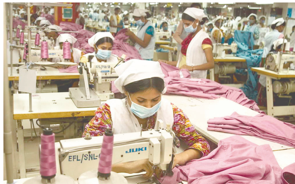
Bangladesh is the world's second-largest ready-made garment exporter. EMBASSY OF BANGLADESH