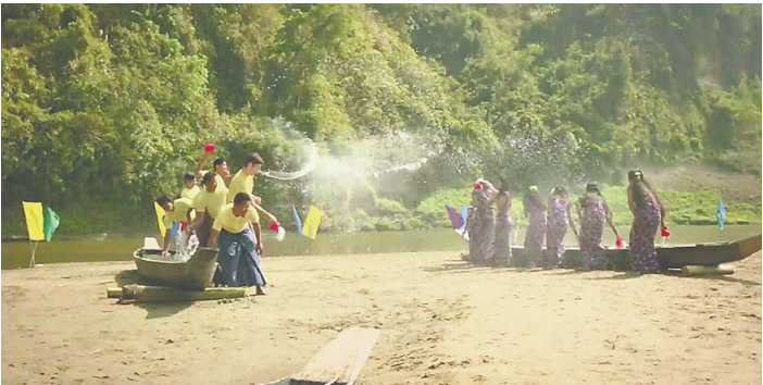
Lush nature and cultural heritage come together in Bangladesh.