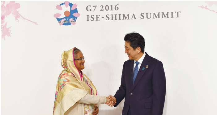
Prime Minister Sheikh Hasina and Prime Minister Shinzo Abe shake hands at the G-7 Ise-Shima summit outreach program in Mie Prefecture in May 2016.

nation to resist the enemies. The occupation forces unleashed a sudden attack and started killing innocent and unarmed Bangladeshis on the black night of March 25, 1971. They killed thousands of people in cities and towns, including Dhaka. The father of the nation Bangabandhu Sheikh Mujibur Rahman officially proclaimed the independence of Bangladesh at the first hour of March 26, 1971. Bangabandhu's proclamation was spread all over the country through telegrams, tele-printers and EPR wireless. The international media also had circulated Bangabandhu's proclamation of independence. Under the brave and dauntless leadership of Bangabandhu, we earned the ultimate victory of Dec. 16, 1971, after a nine-month bloody war. The independence earned through supreme sacrifices of millions of people is the greatest achievement of the Bangalee nation. To ensure that this achievement remains meaningful, all have to know the history of our great liberation war and retain the spirit of independence. The history has to be passed on to generation to generations. Being imbued with the spirit of the freedom struggle, the Awami League government has been working relentlessly to develop the country. During the last nine years, we have implemented expected development programs in all sectors. As a result, Bangladesh has emerged as a role model of socioeconomic development. The world is now