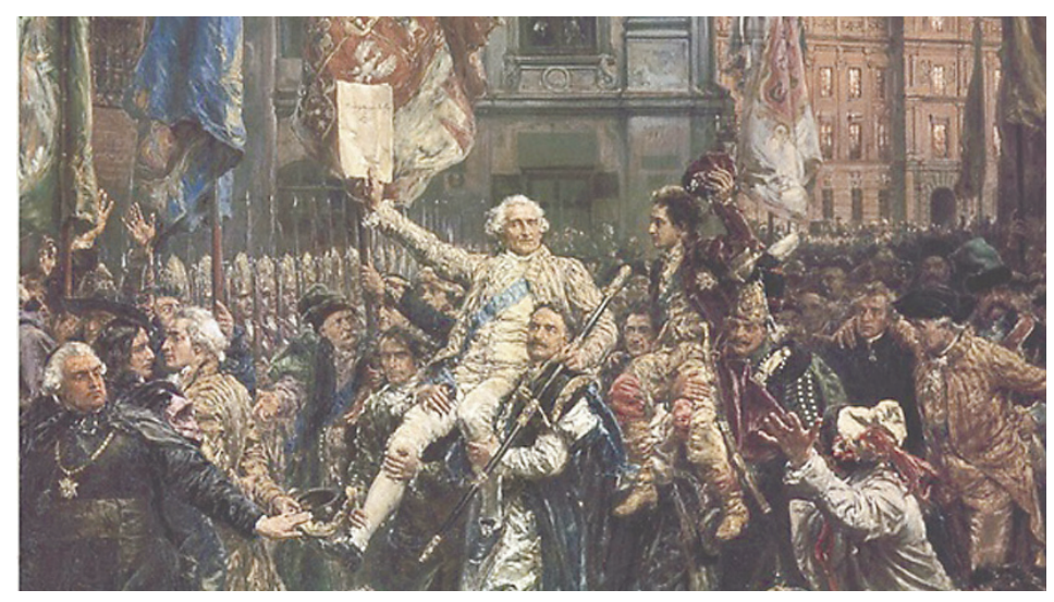
Part of Jan Matejkos's "The Constitution of May 3, 1791." This work memorializes the Polish Constitution that is also Europe's first. MINISTRY OF FOREIGN AFFAIRS, POLAND

This content was compiled in collaboration with the embassy. The views expressed here do not necessarily reflect those of the newspaper.