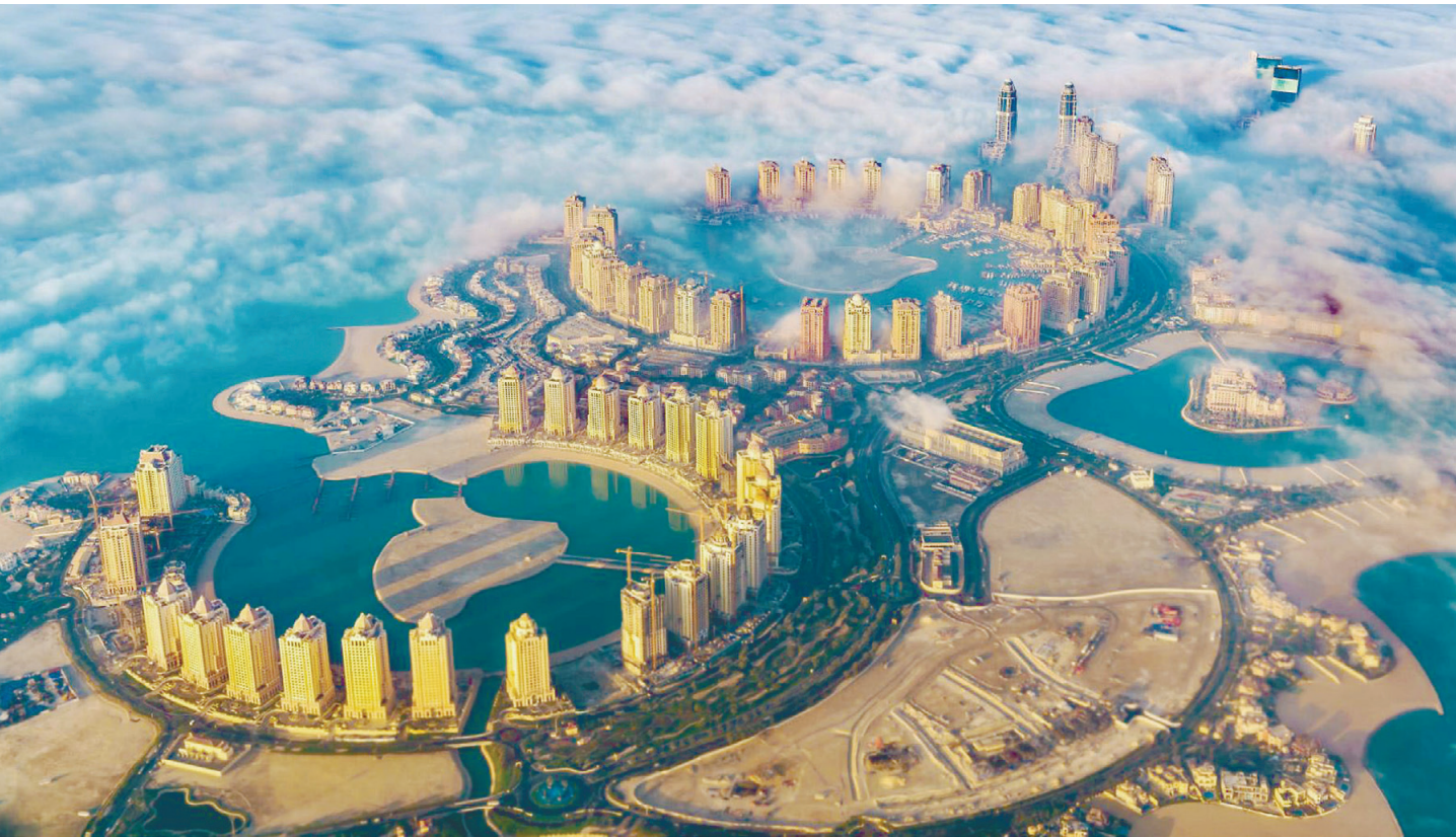
Top: Souq Waqif is a traditional market in Doha that's known for selling crafts and spices as well as hosting events amid an abundance of dining locales. Above: An aerial view of The Pearl, an artificial island in Doha.

Heartiest Welcome to His Highness Sheikh Tamim Bin Hamad Al-Thani, Emir of Qatar, on his Official Visit to Japan