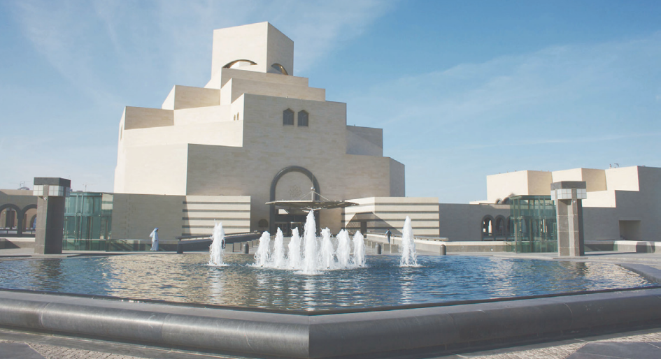
The Museum of Islamic Art's design fuses ancient Islamic architecture with geometrical form. It houses a collection of artworks spanning over 1,400 years. EMBASSY OF QATAR

level delegation comprised of ministers, senior officials and businesspeople. During the visit, the two countries will sign a number of bilateral agreements that will contribute to the further development of relations between the two countries.