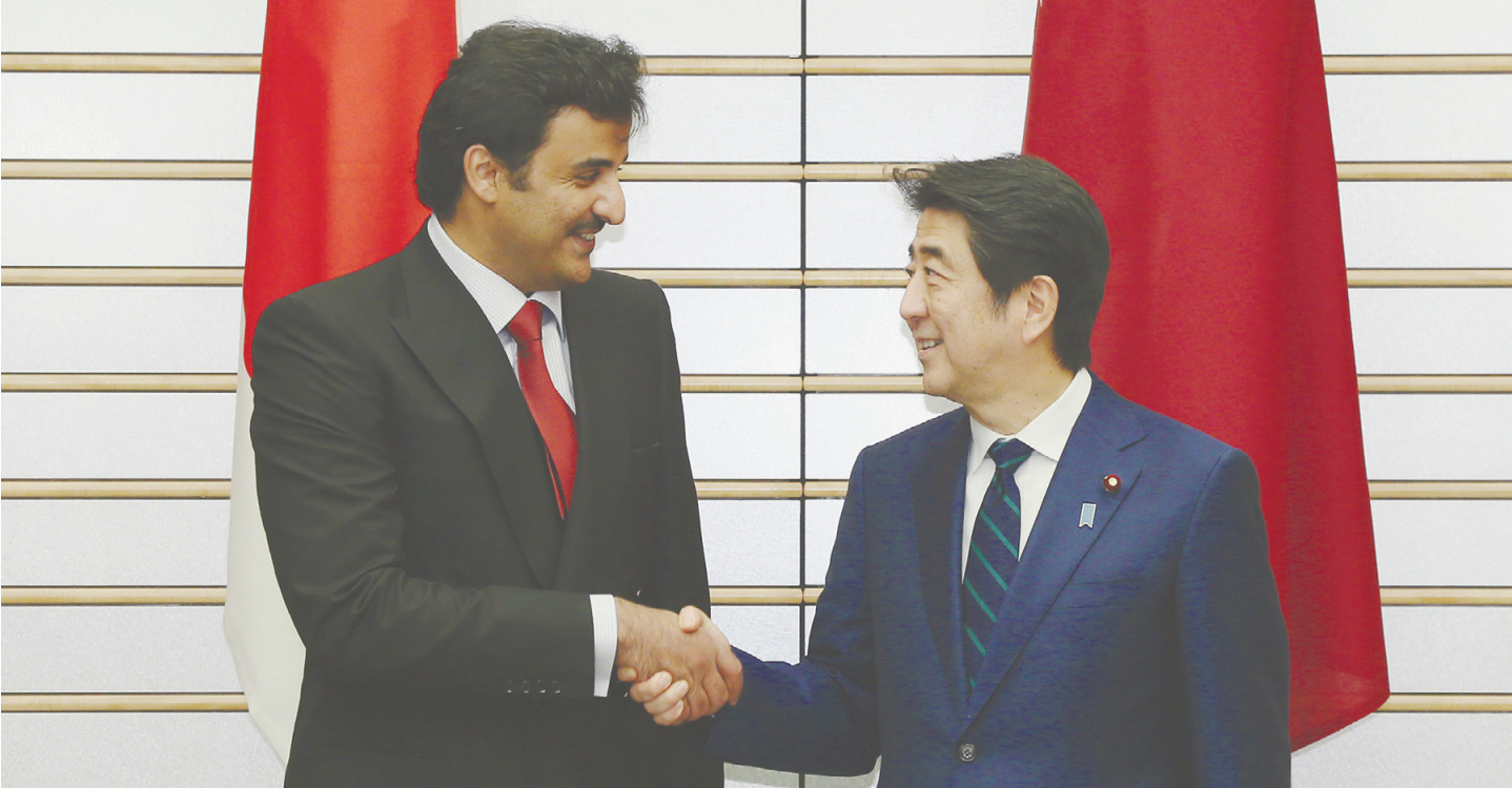
His Highness the Emir Sheikh Tamim bin Hamad Al-Thani and Prime Minister Shinzo Abe shake hands at their summit meeting in Tokyo in February 2015, furthering bilateral relations in various fields including economy.

Efforts to enhance and strengthen ties with Japan are based on the vision of his highness and the political will of the two countries to move relations from the stage of cooperation to a comprehensive strategic