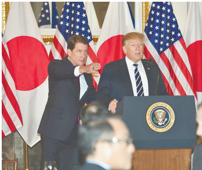
President Donald Trump and Ambassador William Hagerty attend a discussion with Japanese business leaders held at the ambassador's residence in Tokyo in May.