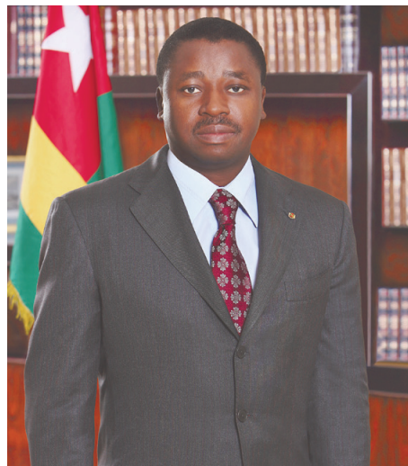
Togo President H.E. Faure Essozimna Gnassingbe

Not only are we able to reflect on our common past, but above all, develop new perspectives and strategies to consolidate cooperation between Japan and Togo. I would therefore like to congratulate the Japanese government for the organization of TICAD 7 that has enabled Japan and its African partners, including Togo,