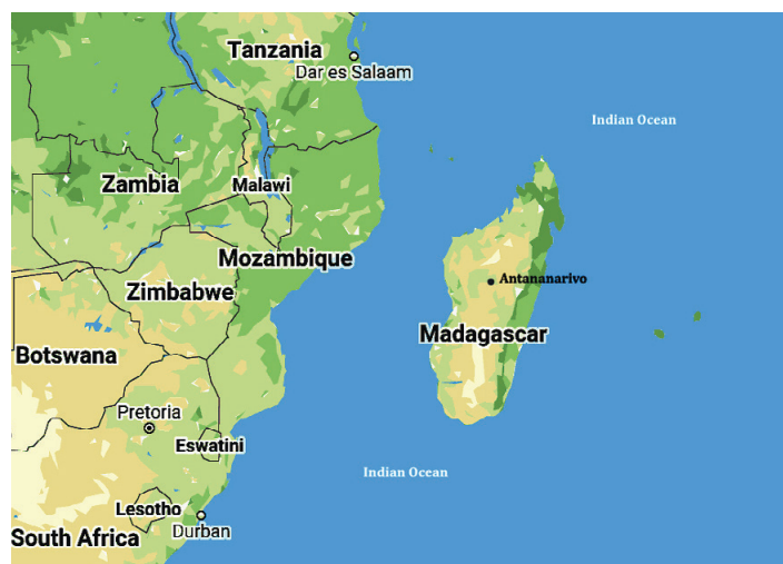
Map of Madagascar

This content was compiled in collaboration with the embassy. The views expressed here do not necessarily reflect those of the newspaper.