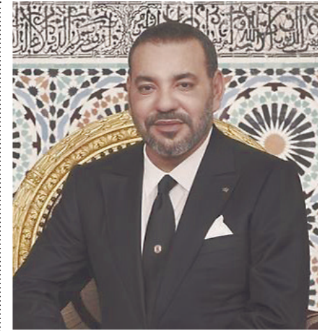
H.M. King Mohammed VI

Tough times bring opportunity — even in this unprecedented situation, I believe we can strengthen our friendly ties. I wish for the health and prosperity of the people of Morocco, as well as further development of the bond between us.