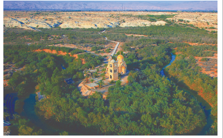
The Baptism Site of Jesus Christ was recently designated a UNESCO World Heritage Site.

ideals and vision espoused by the founding Hashemites in creating the emirate embodied the deeply entrenched values and principles of justice, compassion, inclusion, and representation in the political process. As early as 1929 a constitution was promulgated, and elections held, bringing about the first parliament, then known as the Legislative Council. Today, 100 years later, Jordan proudly looks back and celebrates standing the test of a time that often cast doubt on its viability and brought with it countless trials and tribulations.