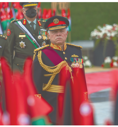
His Majesty King Abdullah II tours Martyrs' Square during centennial celebrations in Amman.