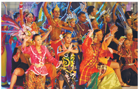
Malaysia, home to a diversity of cultures

While this year's theme "Malaysia Prihatin " ("Malaysia Cares") was maintained from 2020, the Malaysian government also introduced the National Recovery Plan (NRP), which serves as a road map to control the pandemic while progressively reopening society and the economy. Specifically, the NRP aims to protect public health, ensure the sustainability of the health care system,