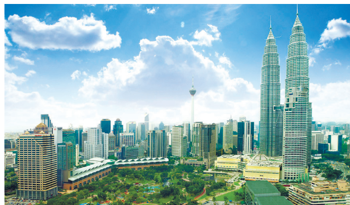
The iconic Petronas Twin Towers of Kuala Lumpur TOURISM MALAYSIA

108-1, Saiin-Tsukiso-cho, Ukyo-ku, Kyoto 615-0054 JAPAN