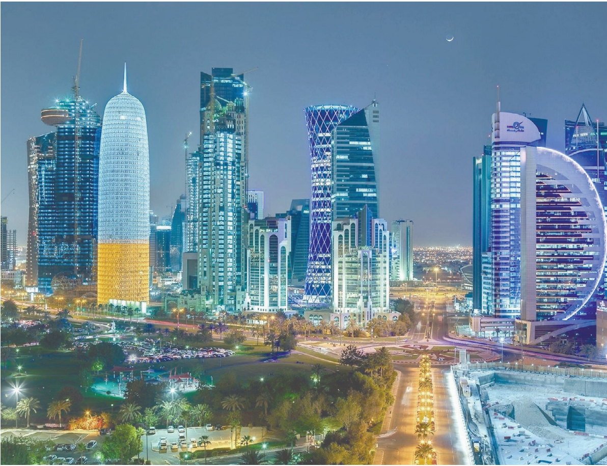
Doha's evening skyline offers spectacular views.

This content was compiled in collaboration with the embassy. The views expressed here do not necessarily reflect those of the newspaper.