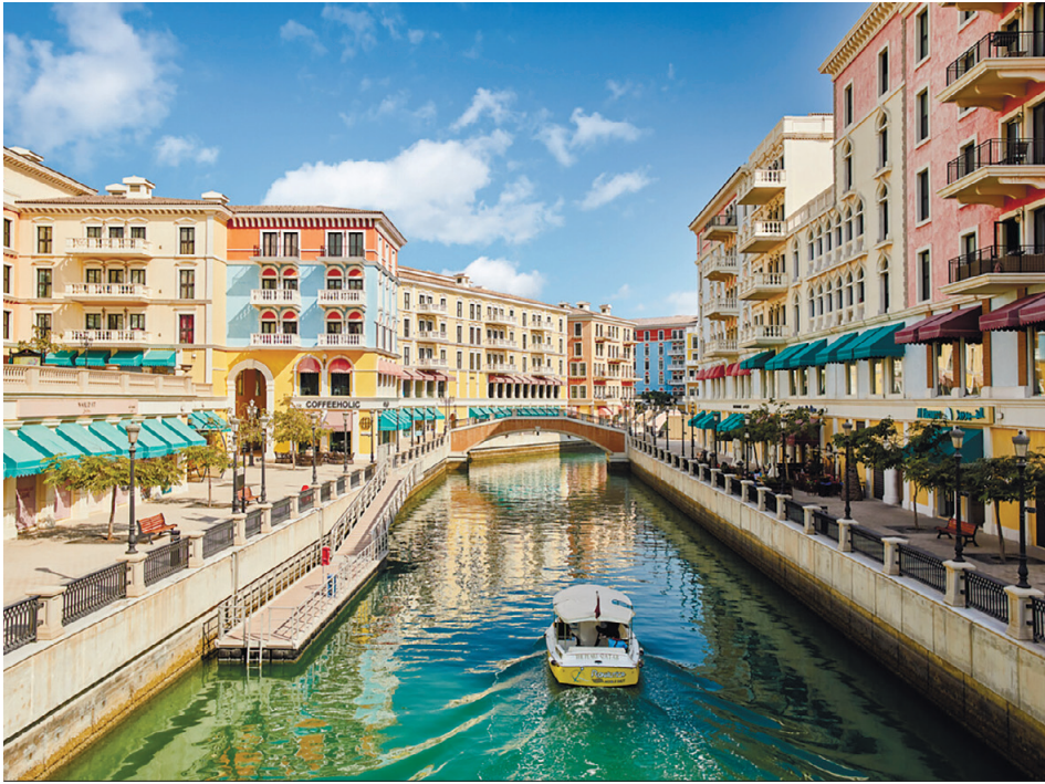
The Qanat Quartier is located in the Pearl, where Venetian charm meets Arabian chic

Foreign Minister H.E. Toshimitsu Motegi. Bilateral cooperation in the field of education is expanding, as the Qatar Chair for Islamic Area Studies project was inaugurated at Waseda University in May. Preparations in the two countries are in full swing to celebrate the 50th anniversary of the establishment of diplomatic relations between the two countries, in March. These developments lay the solid foundations for building a comprehensive strategic partnership between our two friendly countries. In closing, I wish to express my deepest appreciation to The Japan Times for giving me this opportunity to address its distinguished readers on this happy occasion, wishing all peace, health, happiness and prosperity in the coming new year.