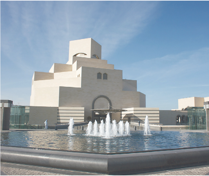
Above: The Museum of Islamic Art in Doha showcases Islamic art dating back more than 1,400 years. Right: The Souq Waqif is a traditional market in Doha.