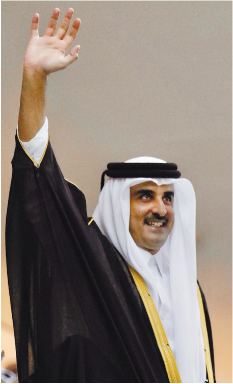
The Amir of the State of Qatar His Highness Sheikh Tamim bin Hamad Al-Thani

Today the State of Qatar celebrates its National Day, the glorious anniversary of the founding of our beloved country. Dec. 18 is a day when the people of the State of Qatar remember the sacrifices and achievements of the founders, our fathers and grandfathers, and their heroic and epic roles in achieving the unity of our country, affirming its sovereignty, preserving its heritage and building the modern state. On this very special occasion, I am honored to express, on behalf of the Amir His Highness Sheikh Tamim bin Hamad Al-Thani, the government and people of the State of Qatar, my deepest reverence, warmest greetings and best wishes for good health and happiness to Their Imperial Majesties Emperor Naruhito and Empress Masako, the imperial family, Prime Minister Fumio Kishida, the government and the friendly people of Japan. This is a great occasion to reflect on our national achievements. Under our wise leadership, and in accordance with the Qatar National Vision 2030, the State of Qatar has undergone a rapid modernization process with a society whose standard of living has risen by leaps and bounds. In October, the Qatari people made a historic achievement and enthusiastically participated in the first national elections to select two-thirds of the 45-member Shura Council. These elections were one of our country's broad strategies that aim to consolidate the rule of law, building the institutions and developing the legislative process with