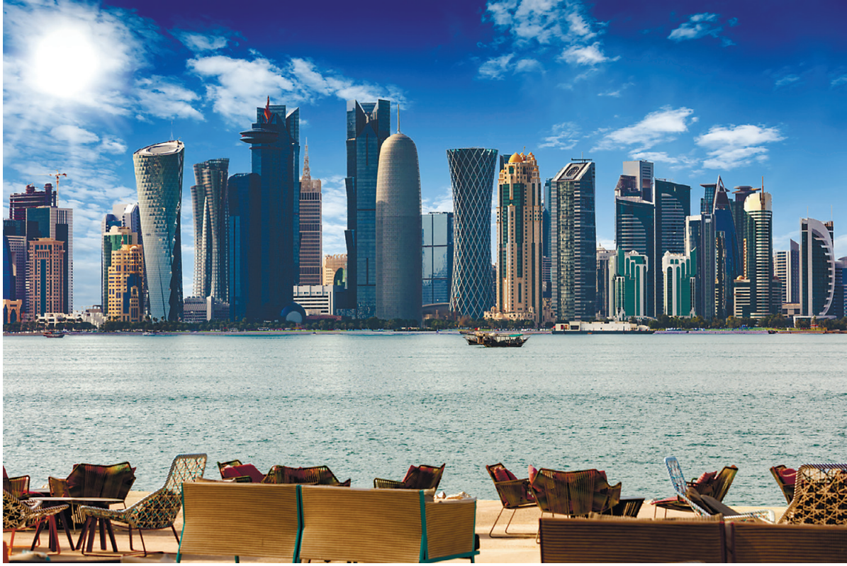
Doha's skyline