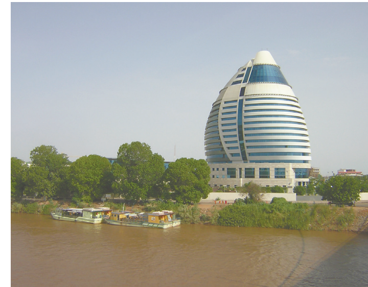
The Corinthia Hotel Khartoum sits at the confluence of the White Nile and Blue Nile rivers.

This content was compiled in collaboration with the embassy. The views expressed here do not necessarily reflect those of the newspaper.