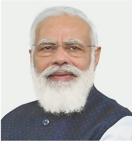
Prime Minister Narendra Modi EMBASSY OF INDIA

ity and maritime transport pillar of India's Indo-Pacific Oceans Initiative, which is an open, inclusive, nontreaty-based global plan for mitigating challenges, especially in the maritime domain. Partner countries are committed to taking forward the vision of "the Quad" in key and strategic areas, including vaccines, climate change, critical and emerging technologies, quality infrastructure development, space, cyber, education and people-to-people cooperation for a secure, peaceful, prosperous and stable Indo-Pacific.