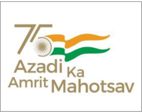
Above: The logo for India's 75th independence anniversary reads, "Elixir of Energy of Independence." Left: The Indian Navy and Japan's Maritime Self-Defense Force take part in exercises in the Bay of Bengal in January.