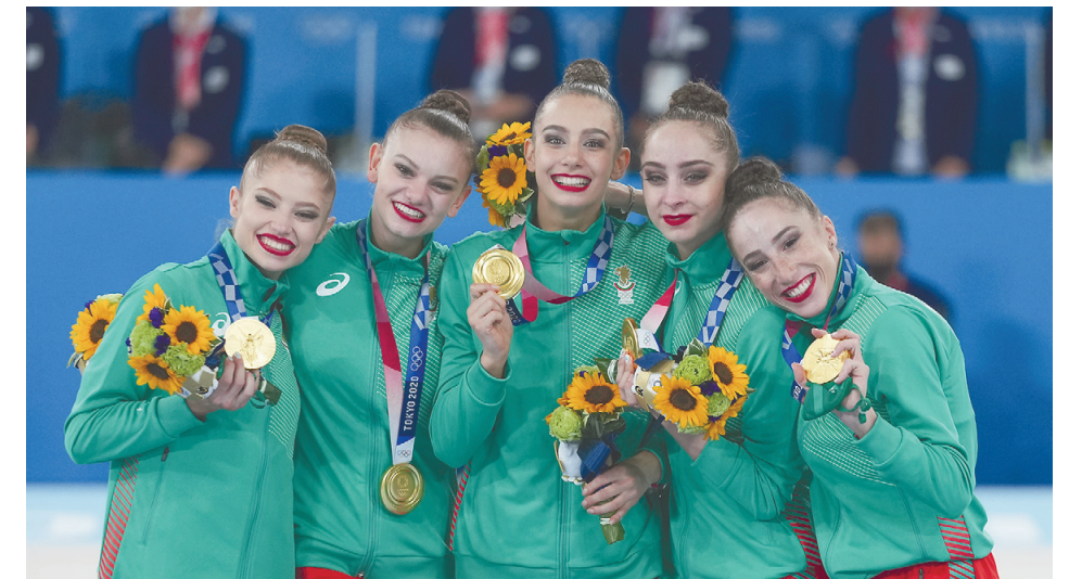
Above: The Bulgarian rhythmic gymnastics team celebrates its historic gold medal on Aug. 8, 2021, at the Olympic Games in Tokyo. Left: Bulgarian Ambassador Marieta Arabadjieva poses with then-Foreign Affairs Minister Toshimitsu Motegi on April 8.